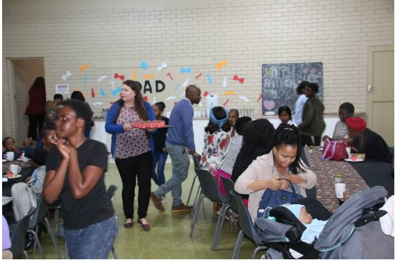
Honouring the Fathers after service

We seek the kingdom of God and His righteousness first by loving God and loving people. The Bible is very simple. How do we love God? By loving people. How do we love people? By discipling them. (Matt 22:27-40; Matt 28:19-20)