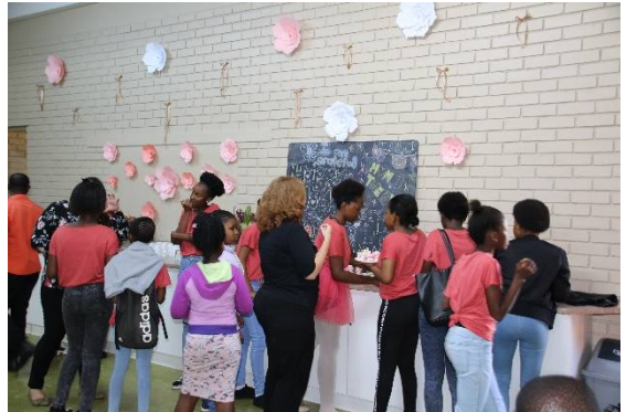
Honouring our mothers after service