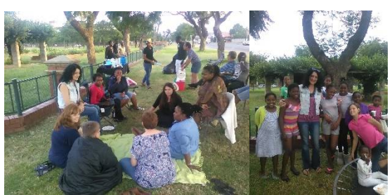
Braai in the Park March 2017

We have seen salvations of people from various religions where they have come to the Lord Jesus, been baptized, filled with the Holy Spirit and are now teaching new Christians through School of Leaders, Life Groups and imparting in their lives where possible. It is amazing to see the transformation and growth in their lives, the hunger after God and their devotedness. The growth is slow, but it is deep and we are grateful to God.