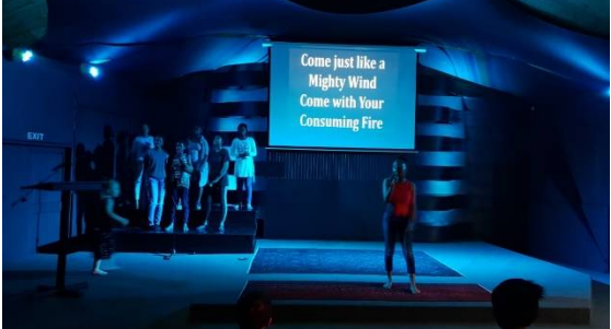
Youth Preparing for Service

Sunday Services are at 09:00. Sundays 10:30-11:30 we have our School of Leaders running with 7 different models simultaneously every term, where our aim is to: